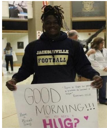
Jacksonville High School FOCUS Group

Click here to view Jacksonville High School's Peer Helpers Discussion on Mental Health, by Amy McCreless