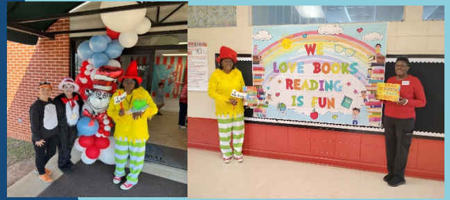
Special Project-Dolly Parton Imagination Library events in March, 2025.